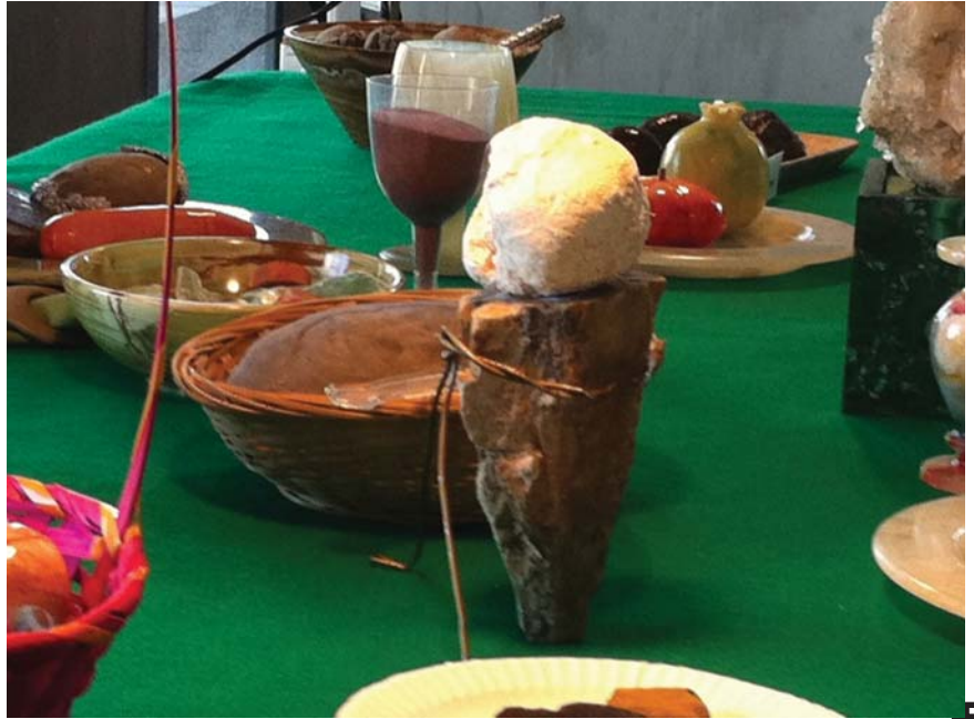
Part of Rich Stein's mineral table. Note new ice cream cone. From display of February 2011 at NYSM.