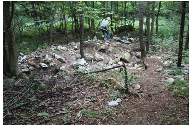
Bill in the mine dump where we collected in West Pierrepoint..